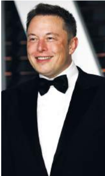
ELON MUSK: He had a vision.

Bill Gates, Steve Jobs, Elon Musk are all products of the US ethos of everything is possible no matter what class you belong to or what school you went to. Also the big three weren't focused on making money initially. They wanted to develop products benefiting mankind and started at the bottom against the odds working day and night for virtually nothing, often in the garage. In 2008, facing bankruptcy, Elon put in all the money he possessed because he had a vision of what could be achieved with Tesla and SpaceX -