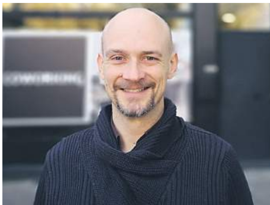
VIRTUAL OFFICES: Locate your business on Google Maps in Spain.

The information and email support is given in 39 languages, including the five regional languages of Spain. The service is affordable for any budget for businesses, entrepreneurs and those who are self-employed, placing your business in front of 447 million people, making it an exceptionally helpful service for startups, SMEs,